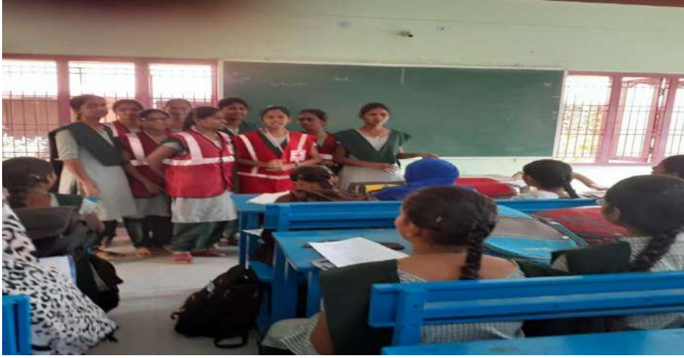
Red cross volunterees motivating the students to maintain premises clean and guiding them not to disuse the electricity and water in the college campus on 12-06-2019.