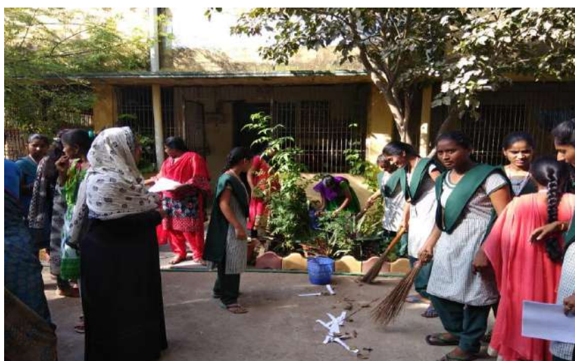
Clean and green activity by Shakti YRC group