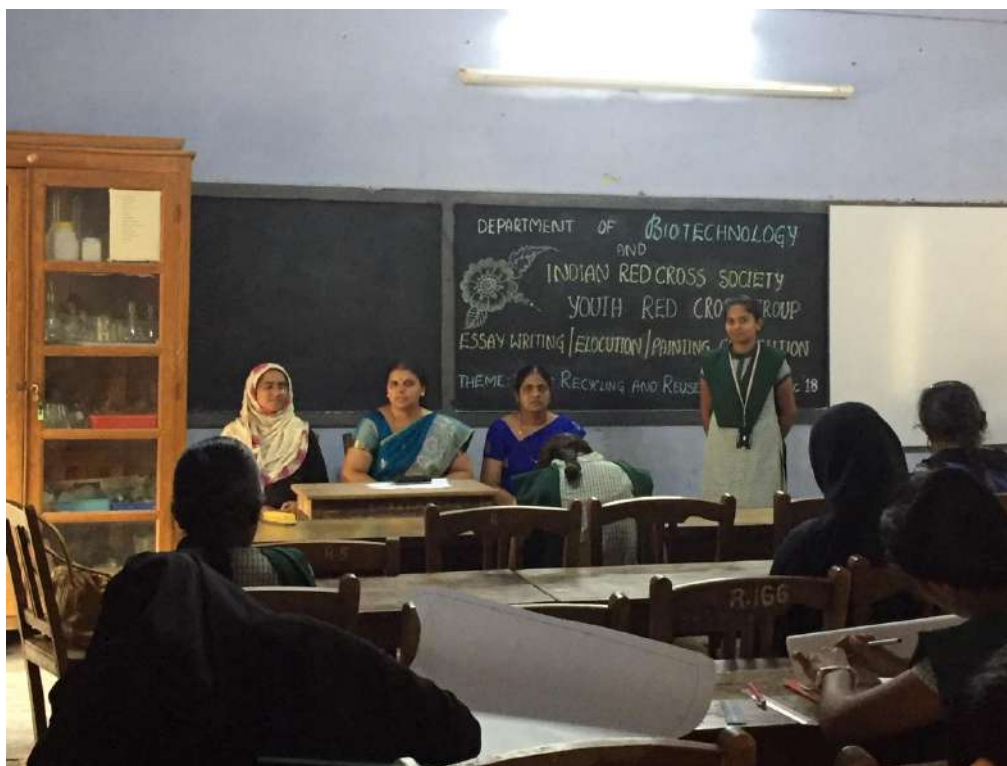
Election competitions conducted by the YRC on 14-12-2018